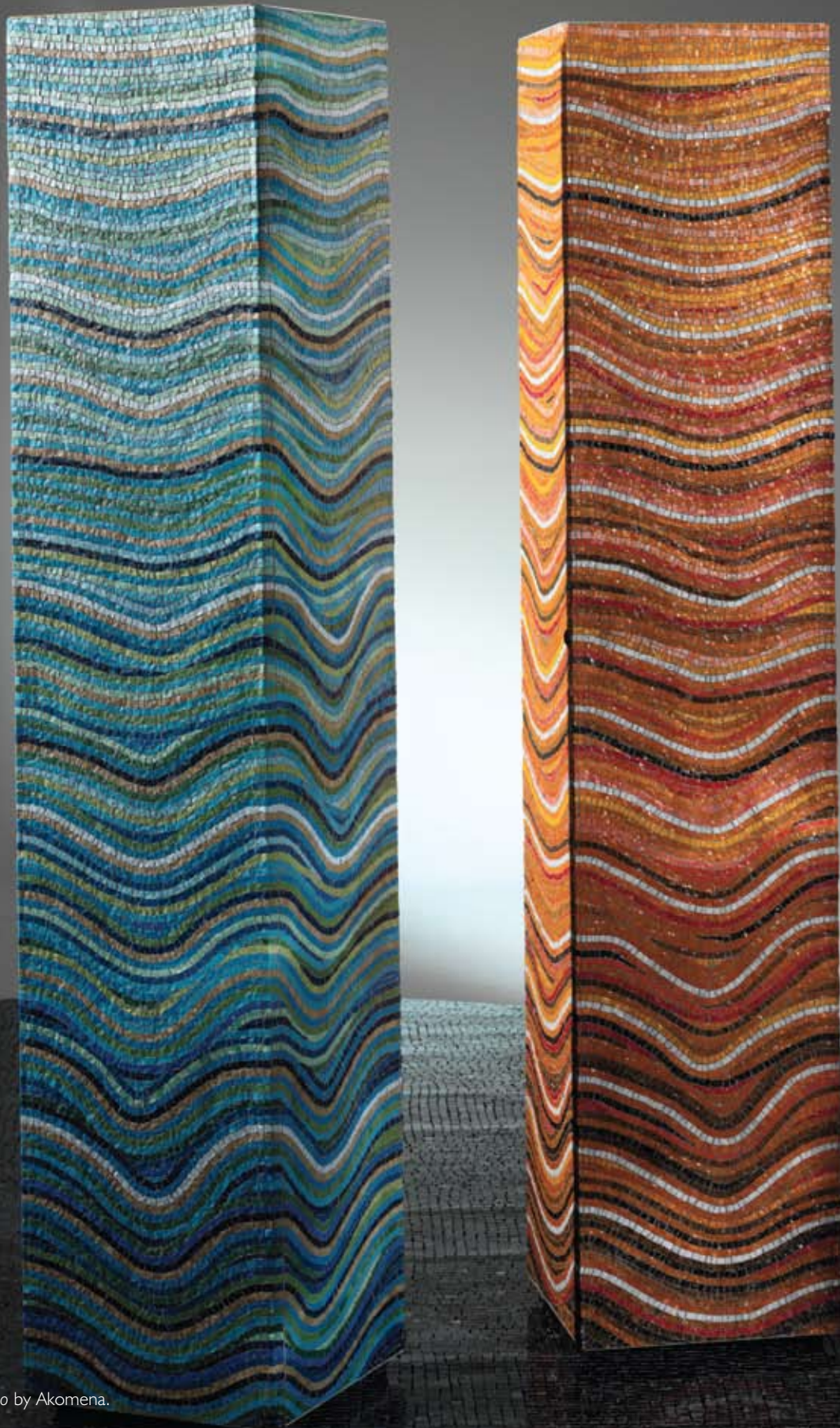
Teodato e Teodosio by Akomena.

Preview the best of contemporary Italian luxury design that will be on show in Abu Dhabi. TEXT: DOROTHY WALDMAN